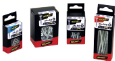
Small cardboard box

Getting the message across through modern, understated packaging