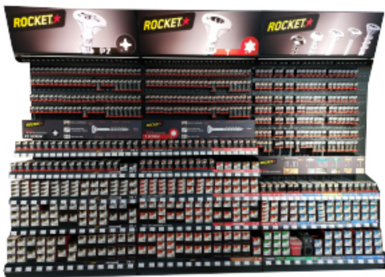
ROCKET wood screw DIY display.