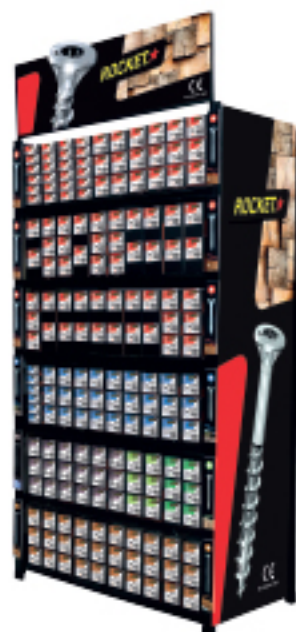
ROCKET screw shelf display in a professional distribution (1 m cardboard box)